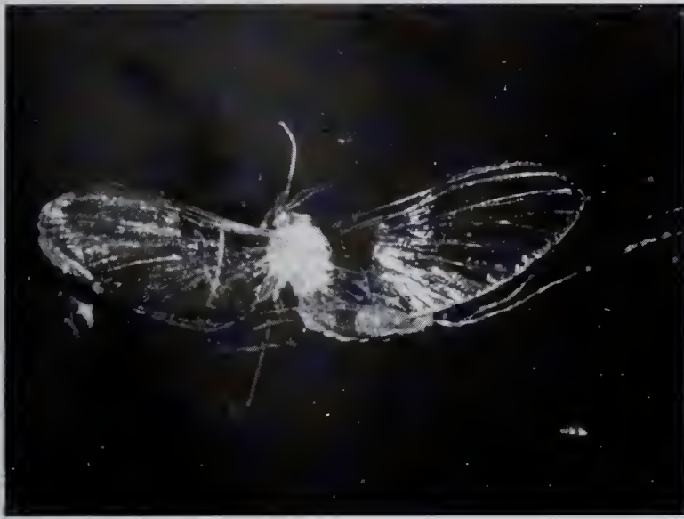
Fig. 2 Myanmarella rossi gen. nov. sp. nov., holotype, In.20173, Burmese amber. Length of right fore wing 2.25mm.

C strongly arched; R and hind branch of anterior RS fork ending in thin fold not reaching outer margin, between hind branches of RS two very weak interrupted longitudinal veins are visible; between MA and IMA two fine folds are visible, the hind one forked, between IMA and MA 2 one weak longitudinal vein; crossvenation restricted to basal and apical parts of wing.